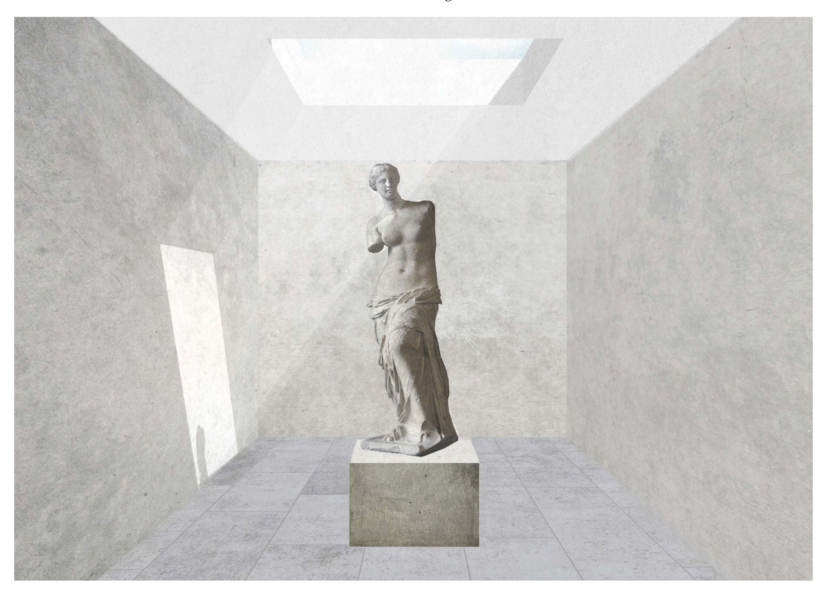
FAKRO ° | New Vison of The Loft 3 | 233307 | 1/4 | ■